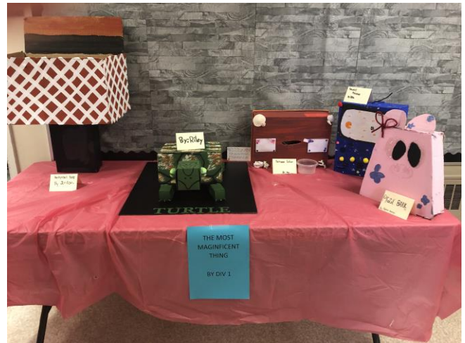
Div. 1 – “The Most Magnificent Thing”

Come and have some input on how we can enhance our children's education at this wonderful school. Also, it is a great way to get to know some more parents, and have some insight on events that are happening at our school.